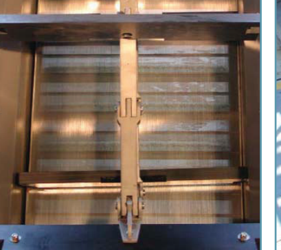
The Duperon<sup>®</sup> FlexRake<sup>®</sup> FS in a single strand application.